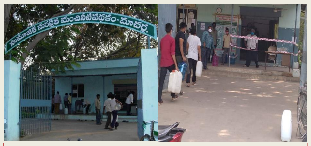
Users Collecting Drinking water from Macherla RO plant

In the wake of outbreak of Corona (Covid -19) virus, with a view to prevent its spreading, we have strictly instructed water users to wear masks while collecting water (by publicizing "NO MASK – NO WATER" message), and also maintaining social distance.