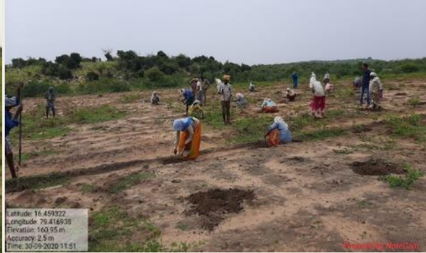
Tree Plantation at Madugula and Macherla Forest area