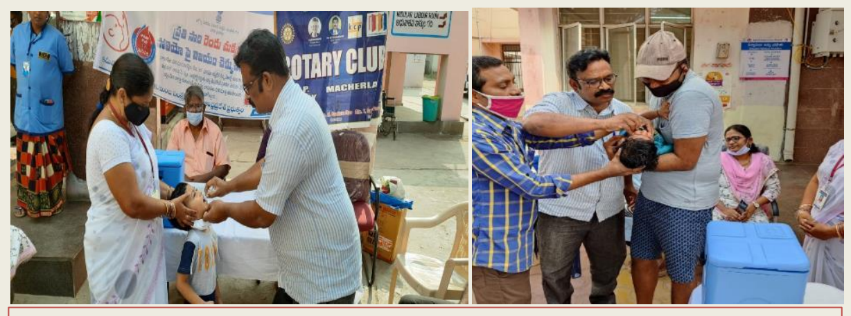
KCP Welfare officer active participation in Polio Vaccination program

In coordination with Rotary club of Macherla, our RCWC coordinator and OHC staff participated in polio immunization program on 31<sup>st</sup> January 2021 in rural villages of Macherla, Veldurthi and Durgi mandals along with Macherla town. Also supported in arranging vechicle to tarnsport the Vaccine to Rural villages.