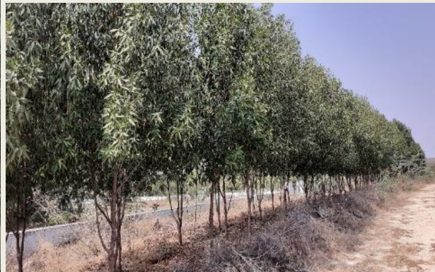
On way to Mandadi village Greenery development

Following our Management principle to contribute for development of as many trees as possible for improving pollution free environment, in coordination with Macherla forest department we have done greenery development program through plantation of 4,440 Saplings at Madugula during September 2020 and 2,200 saplings at Macherla reserve forest area during October 2020 months. For these two programs, plants were supplied by forest department and KCP supported for labour charges for pit digging and samplings plantation.