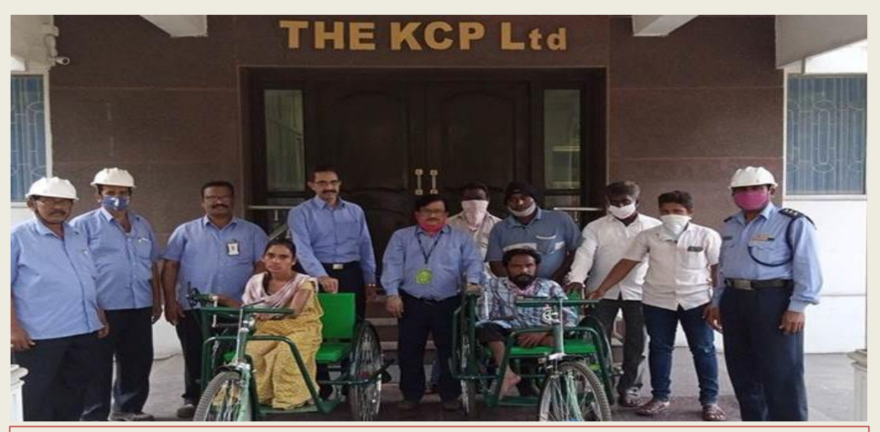
Try-Cycles distribution to Locomotor disability persons

With the help of above Tricycles, these two persons are able to move easily and make their living comfortable and dignified, earning their bread on their own, making their families sustainable. Through this initiative we were able to make the needy in the society happy and productive.