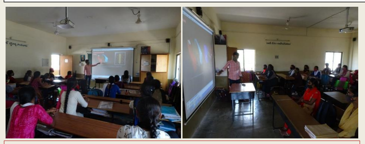
Students Engaged in Digital Class Rooms with Social Distance

KCP CEMENT UNIT – I, Macherla CSR Annual Report FY 2020 – 2021