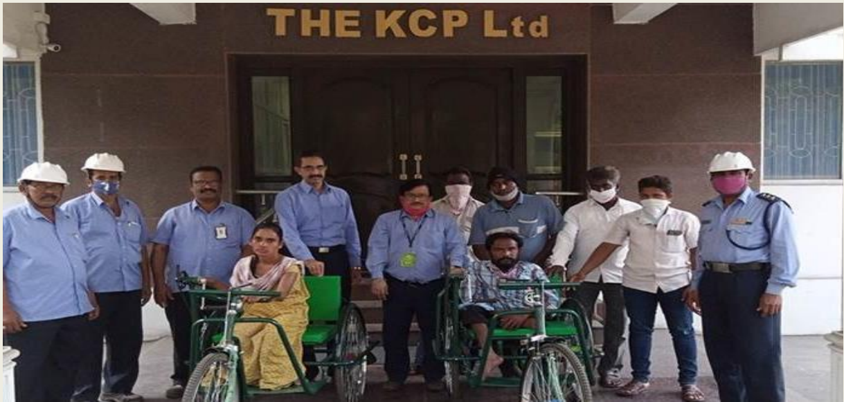
Try-Cycles distribution to Locomotor disability persons

With the help of above Tricycles, these two persons are able to move easily and make their living comfortable and dignified, earning their bread on their own, making their families sustainable. Through this initiative we were able to make the needy in the society happy and productive.