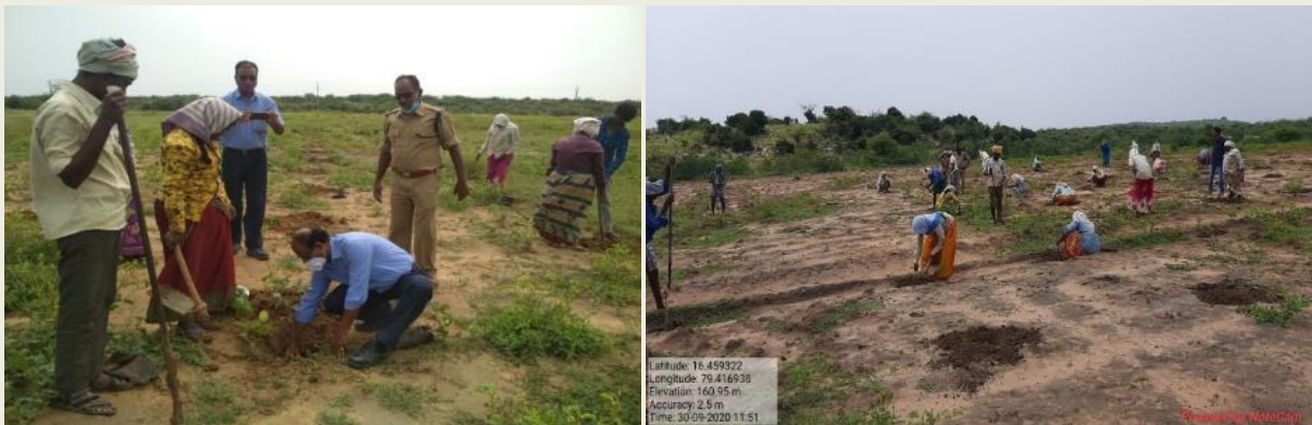
Tree Plantation at Madugula and Macherla Forest area

Following our Management principle to contribute for development of as many trees as possible for improving pollution free environment, in coordination with Macherla forest department we have done greenery development program through plantation of 4,440 Saplings at Madugula during September 2020 and 2,200 saplings at Macherla reserve forest area during October 2020 months. For these two programs, plants were supplied by forest department and KCP supported for labour charges for pit digging and samplings plantation.