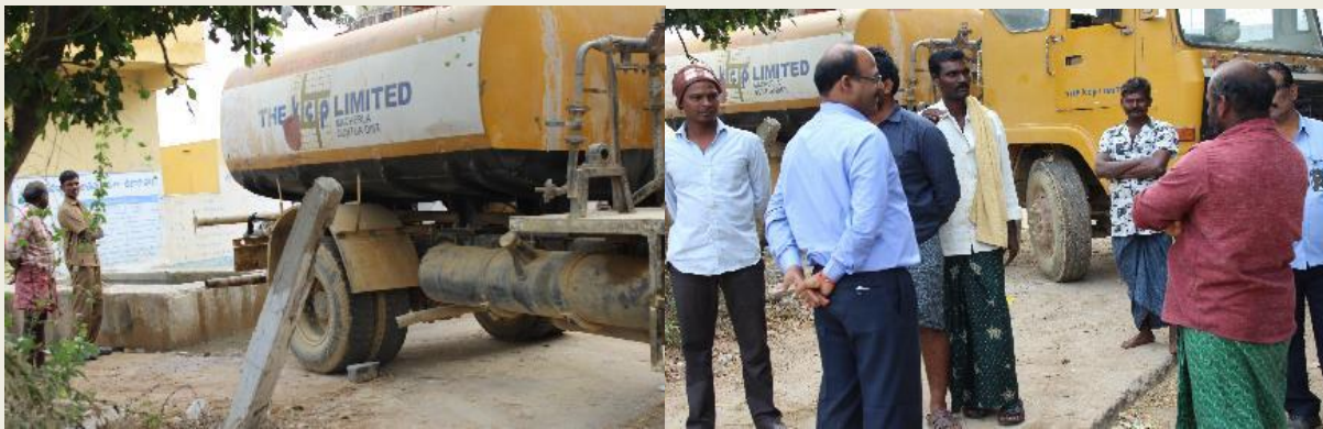
Domestic Usage water supplying to Terala Village

Supplying of domestic consumption water is able to meet the needs of Terala villagers and helped them to overcome the water scarcity. Villagers are thanking our Management for our support in such difficult times.