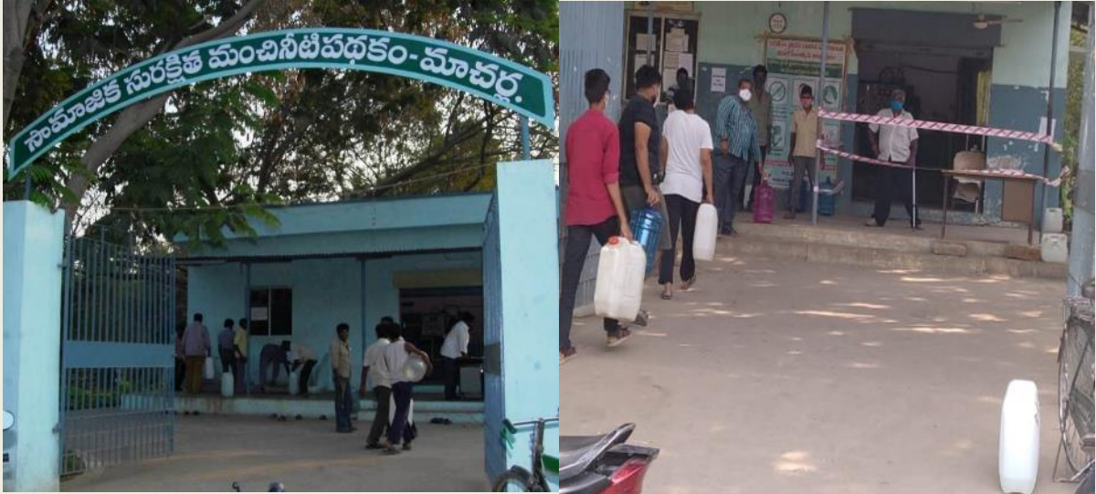
Users Collecting Drinking water from Macherla RO plant

In the wake of outbreak of Corona (Covid -19) virus, with a view to prevent its spreading, we have strictly instructed water users to wear masks while collecting water (by publicizing “NO MASK – NO WATER” message), and also maintaining social distance.