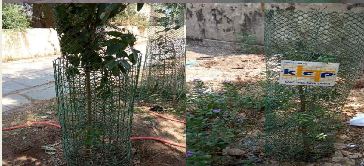
Tree Guards in Macherla Town