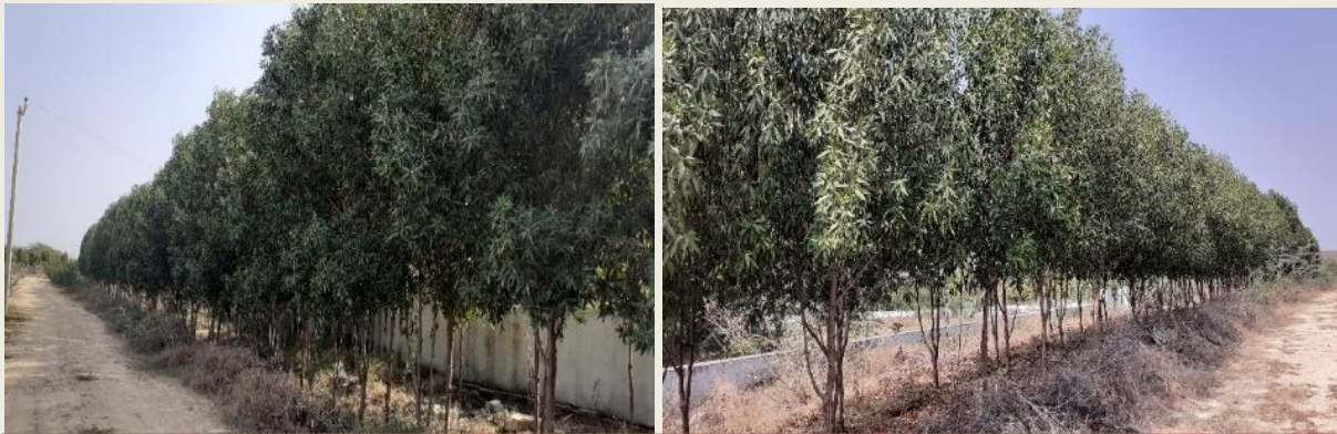
On way to Mandadi village Greenery development

As part of our continued efforts through CSR initiatives, we have planted saplings on 5 th June 2019, on the occasion of World Environment day and making them to grow by watering the same regularly. And also, planted 200 saplings towards Mandadi village.