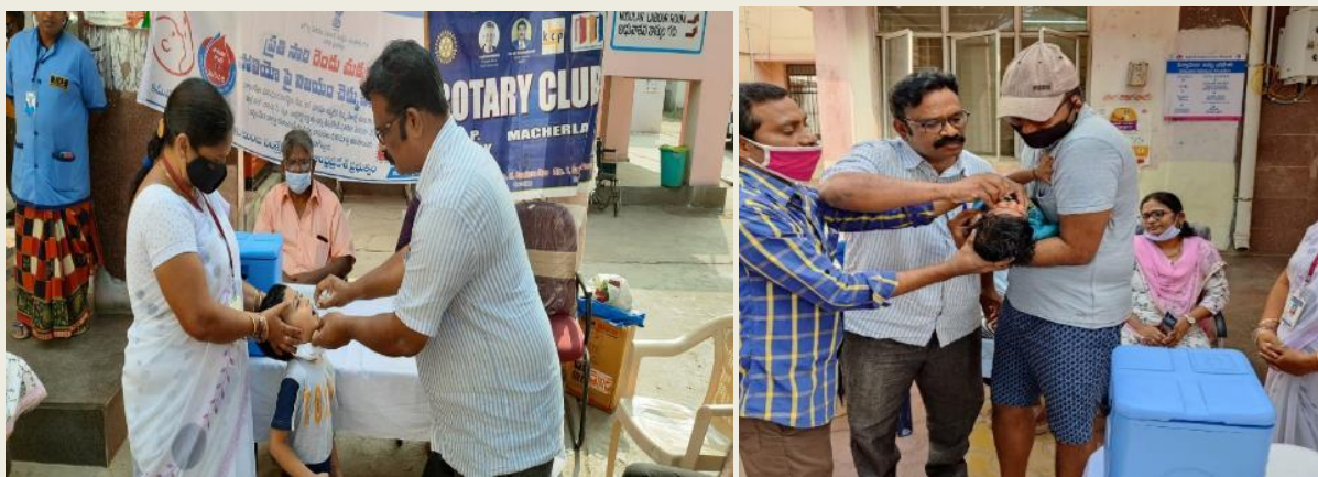
KCP Welfare officer active participation in Polio Vaccination program

In coordination with Rotary club of Macherla, our RCWC coordinator and OHC staff participated in polio immunization program on 31 st January 2021 in rural villages of Macherla, Veldurthi and Durgi mandals along with Macherla town. Also supported in arranging vehicle to transport the Vaccine to Rural villages.